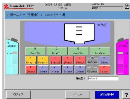
Old operation screen