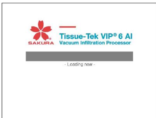
New loading screen (white background)

* The initial program loader is not supplied for field service.