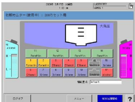
New operation screen